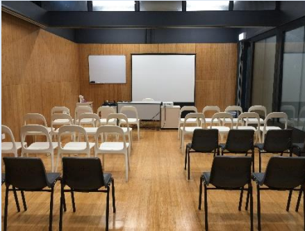
Multi-purpose Room (Max. 40 Persons)

The West Kowloon Mediation Centre (“WKMC”), which is independently operated by the Joint Mediation Helpline Office (“JMHO”), has 2 mediation rooms, 4 breakout rooms and 1 multi-purpose room for mediation and related use.