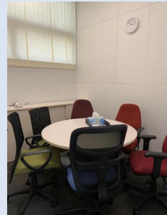
Breakout Room (Max. 6 Persons)